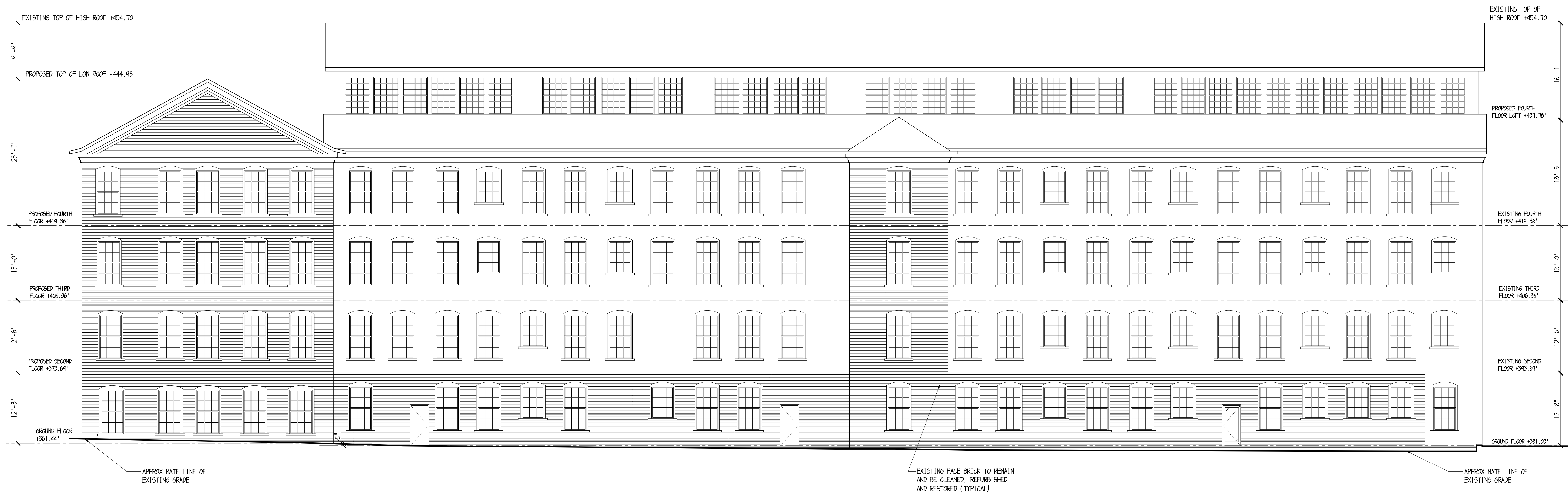
A PROPOSED EAST ELEVATION A-200 SCALE: 1/8" = 1'-0"