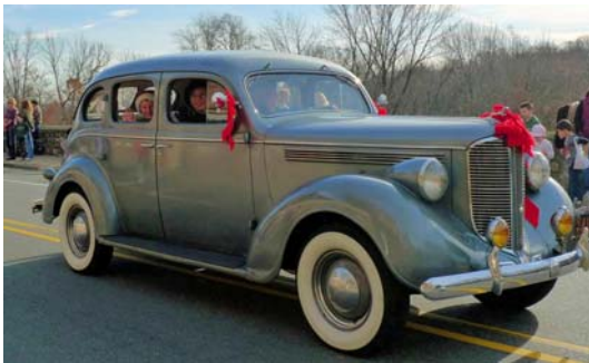
Dick Seabury's 1930's car

It was time to shop till you drop at our gift shop and new gift shop annex which featured candles, holiday gifts, baskets, Boontonware, books and gift ideas for all ages. Bargains aplenty awaited at our holiday open house held on December 4.