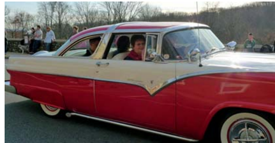
The Evans' 1950's car