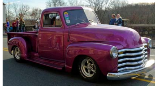
The Kohut's 1940's truck