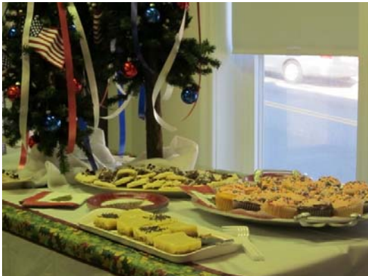
Hot cider and holiday fare greeted our guests.