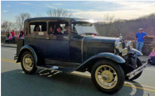
Our lead 1920's car